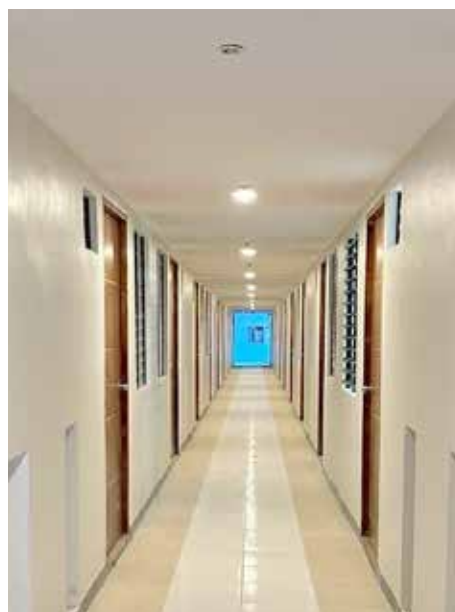
The modern facade and interiors of the new multistory social housing complex.