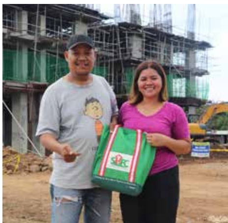
A glimpse of the Quilang's future home in the 4PH townships in Misamis Oriental.