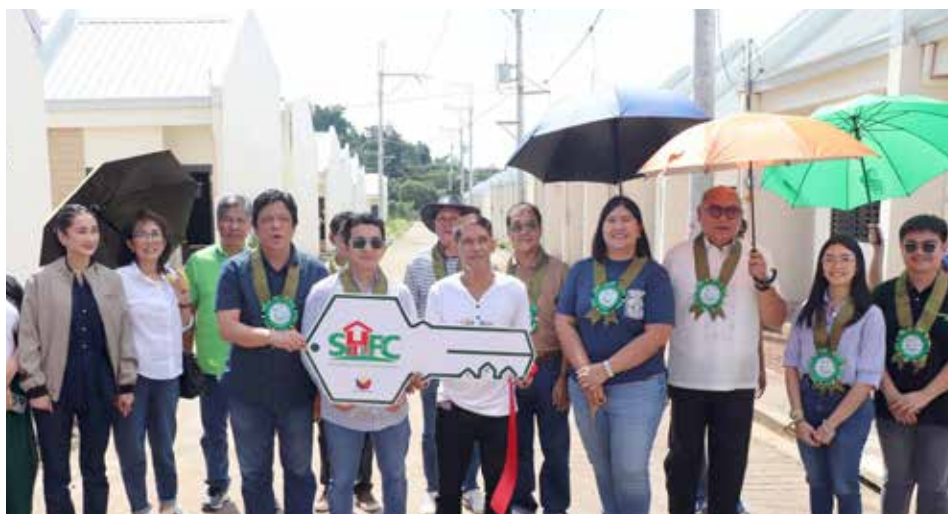
Tinanggap ng mga miyembro ng ICHOAI ang ceremonial key mula sa SHFC noong Nobyembre 17 sa isinagawang turnover ng housing units sa Morong, Rizal.