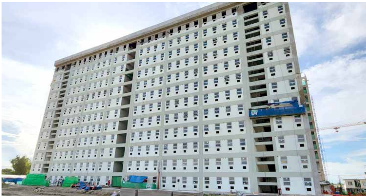
The first of several multistory buildings was constructed at Crystal Peak Estates, a social housing township adjacent to downtown San Fernando, the capital city of Pampanga.