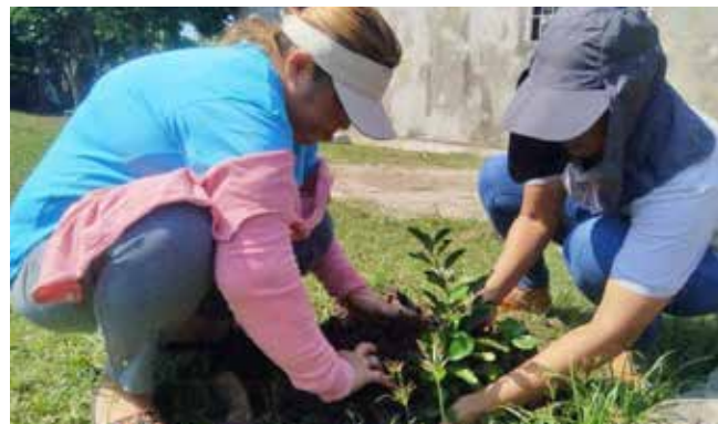
Mga SHFC beneficiaries na tulong-tulong na nagtatanim sa mga bakanteng lupa ng Ibabang Iyam.