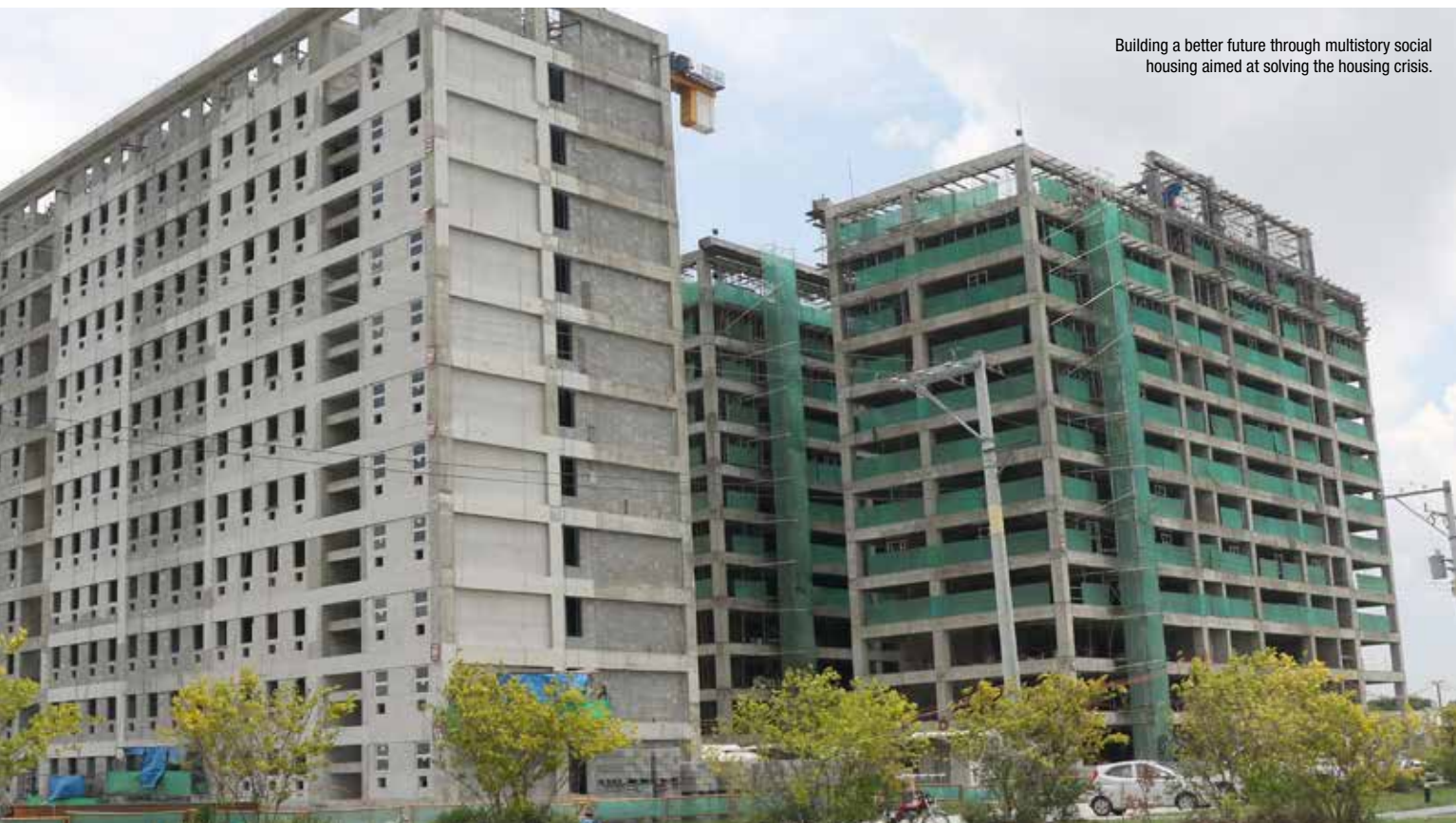
Building a better future through multistory social housing aimed at solving the housing crisis.