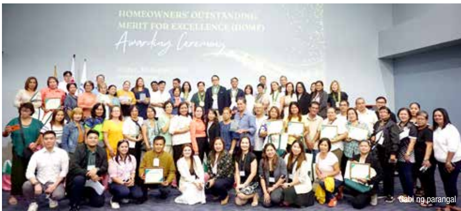
Gabi ng parangal