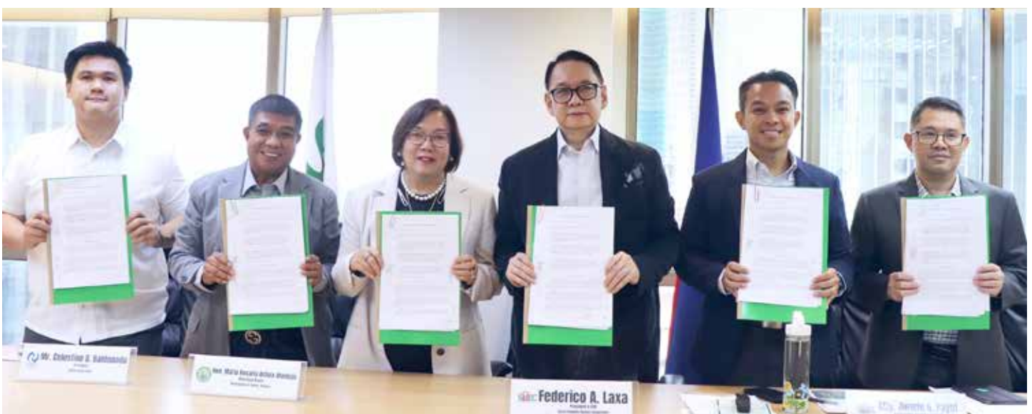
Strong collaboration between SHFC and local government executives are essential in effectively addressing the issue of housing backlogs.