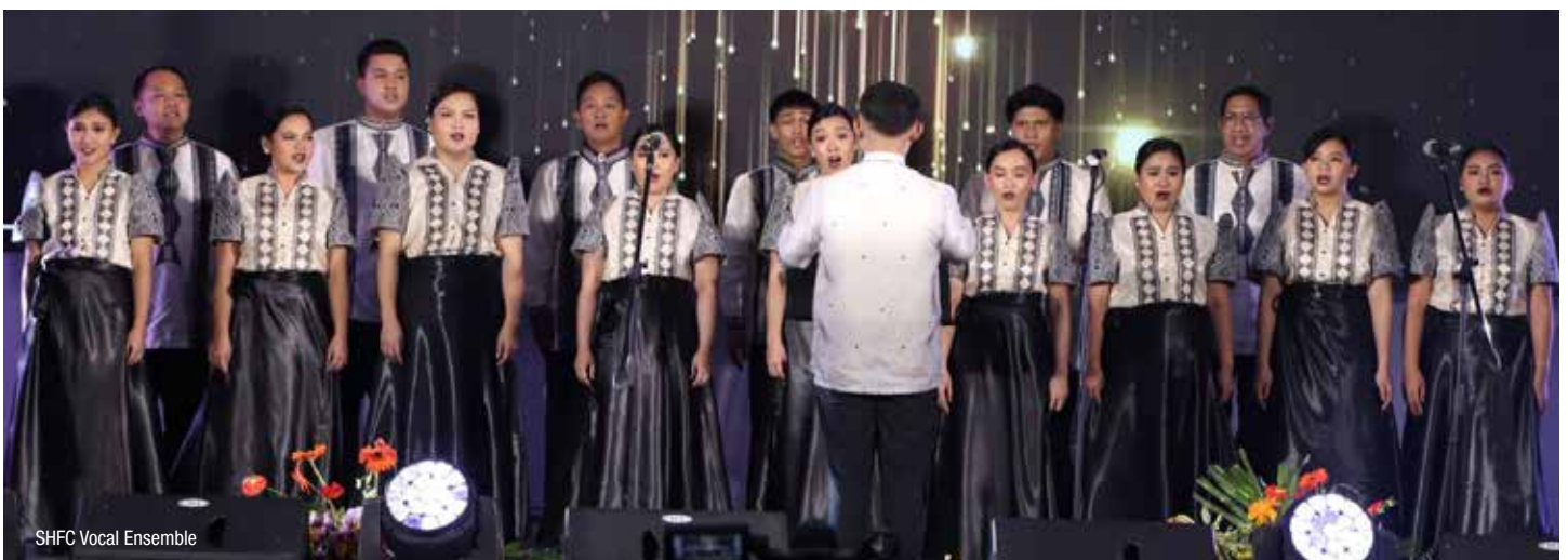
SHFC Vocal Ensemble