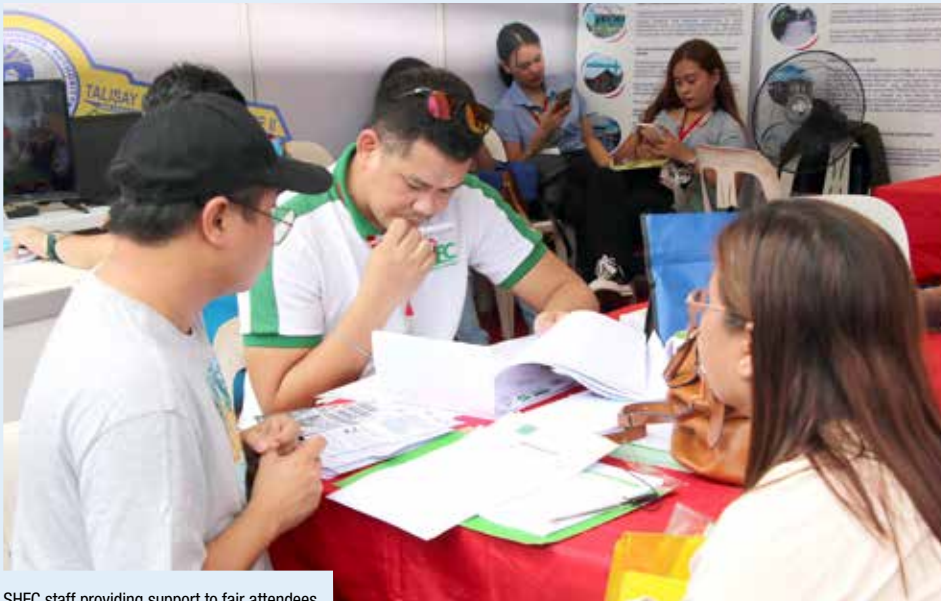
SHFC staff providing support to fair attendees.

Representatives from the SHFC Strategic Communications Department were on hand to provide support to all attendees.