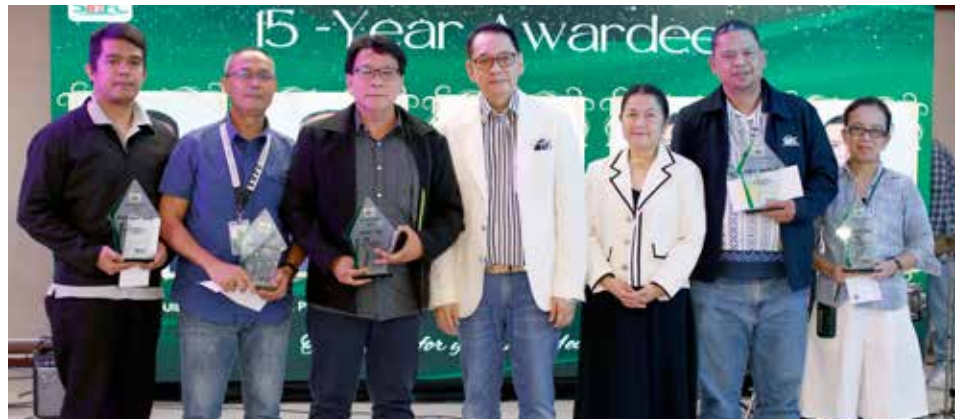
15-Year Loyalty awardees