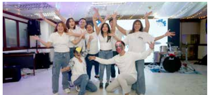
Sing and dance competition champions from Team Aqua Green