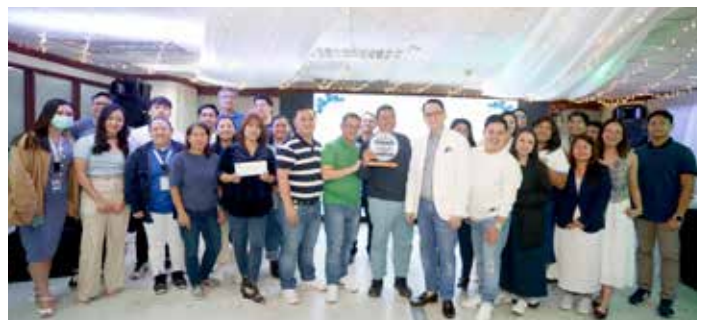
2024 Sportsfest overall champion representatives from the Blue Team