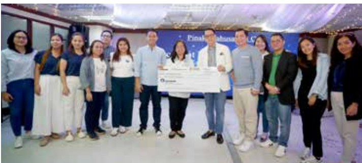
Pinakamahusay sa CER from NCR South