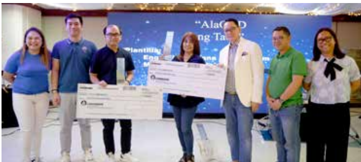
Winners of alaGAD ng Taon